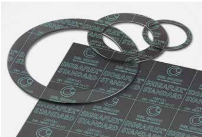
↑ SIGRAFLEX STANDARD sealing sheets and gaskets