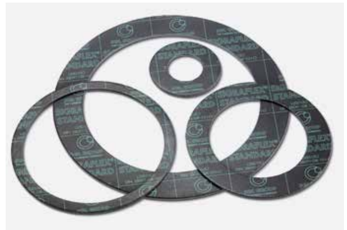
↑ Gaskets made from SIGRAFLEX STANDARD